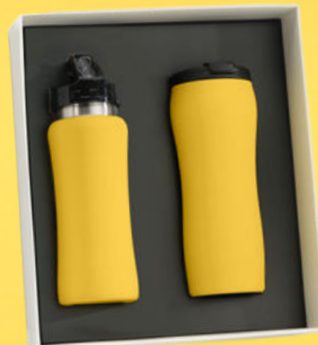
Drinkware set: Water Bottle, 600 ml. & Thermal Mug, 450 ml. HB01/HD02