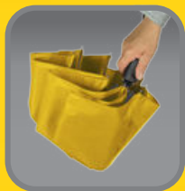
DAS system: 1. press the button to open