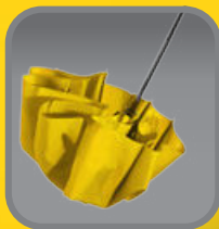
DAS system: 2. press the button to close