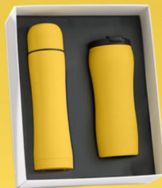
Drinkware set: Thermal Mug, 450 ml. & Thermos, 500 ml. HD02/HT01