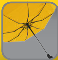
ANTI WIND system