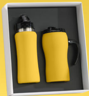
Drinkware set: Water Bottle, 600 ml. & Thermal Mug, 450 ml. HB01/HD01