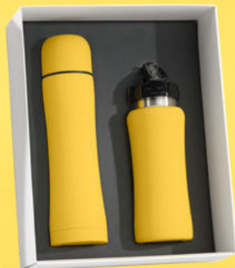
Drinkware set: Thermos, 500 ml. & Water Bottle, 600 ml. HT01/HB01