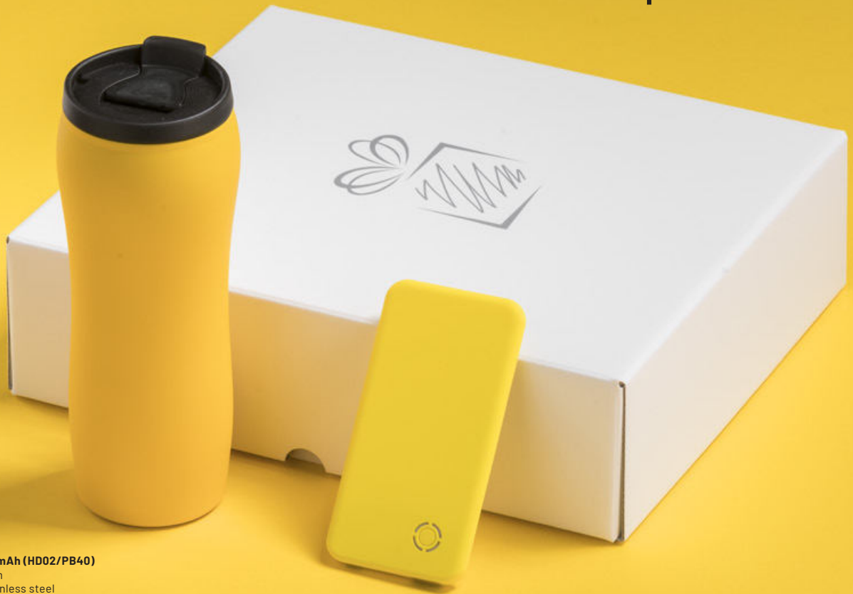
THERMAL MUG 450 ML & RAY POWER BANK 4000 mAh (HD02/PB40) Dimensions: 24,5x31x9,8 cm Materials: ABS, plastic, stainless steel Packing: elegant carton box