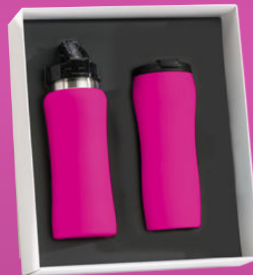
Drinkware set: Water Bottle, 600 ml. & Thermal Mug, 450 ml. HB01/HD02