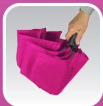
DAS system: 1. press the button to open