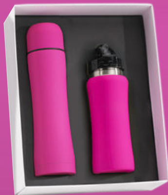
Drinkware set: Thermos, 500 ml. & Water Bottle, 600 ml. HT01/HB01