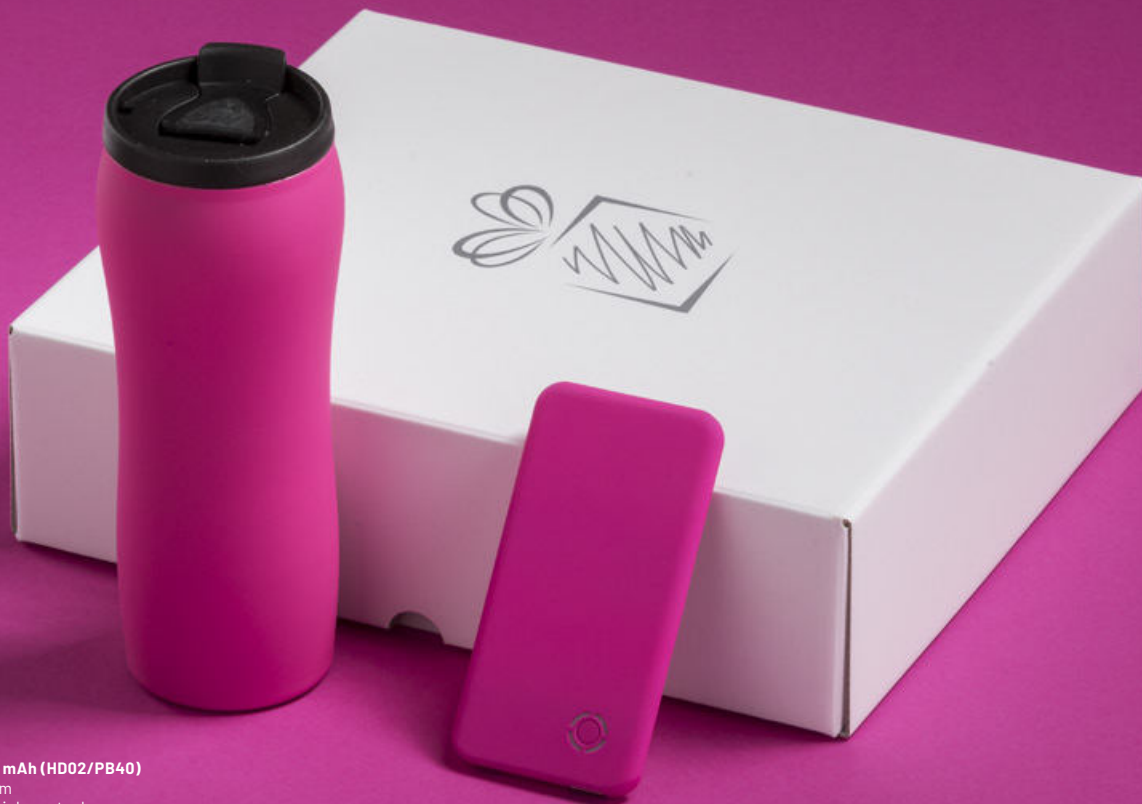
THERMAL MUG 450 ML & RAY POWER BANK 4000 mAh (HD02/PB40)