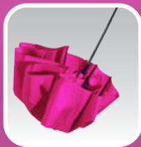
DAS system: 2. press the button to close