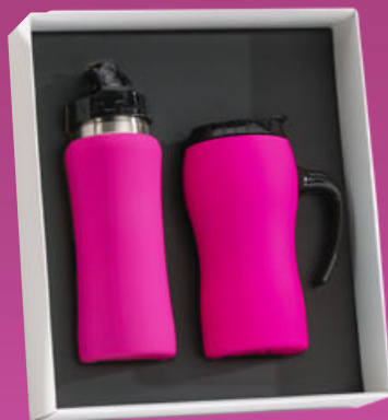
Drinkware set: Water Bottle, 600 ml. & Thermal Mug, 450 ml. HB01/HD01