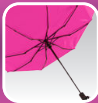
ANTI WIND system