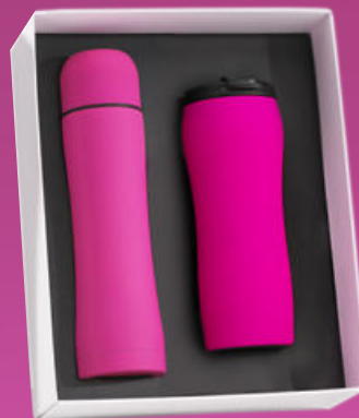
Drinkware set: Thermal Mug, 450 ml. & Thermos, 500 ml. HD02/HT01