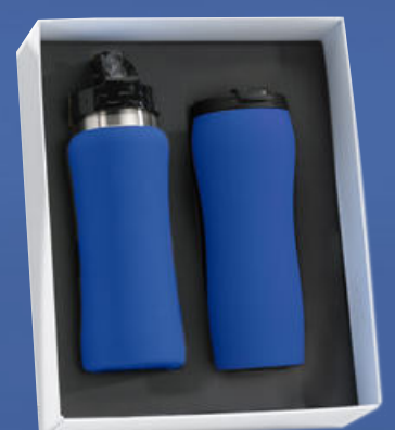
Drinkware set: Water Bottle, 600 ml. & Thermal Mug, 450 ml. HB01/HD02