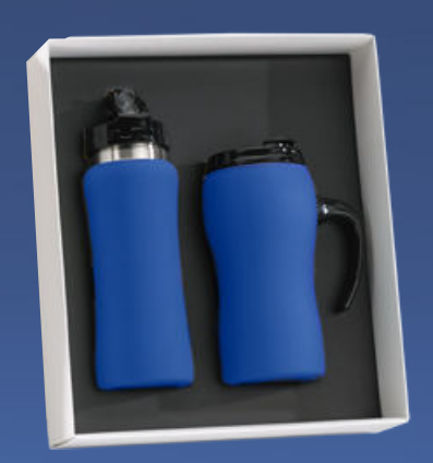
Drinkware set: Water Bottle, 600 ml. & Thermal Mug, 450 ml. HB01/HD01