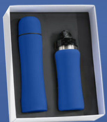
Drinkware set: Thermos, 500 ml. & Water Bottle, 600 ml. HT01/HB01