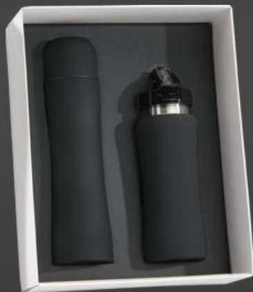
Drinkware set: Thermos, 500 ml. & Water Bottle, 600 ml. HT01/HB01