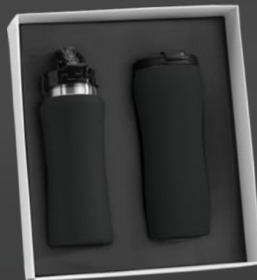
Drinkware set: Water Bottle, 600 ml. & Thermal Mug, 450 ml. HB01/HD02