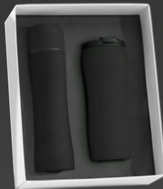
Drinkware set: Thermal Mug, 450 ml. & Thermos, 500 ml. HD02/HT01