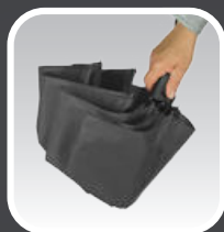
DAS system: 1. press the button to open