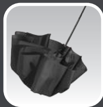
DAS system: 2. press the button to close