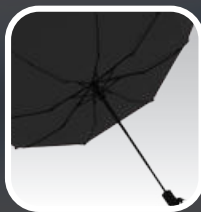
ANTI WIND system