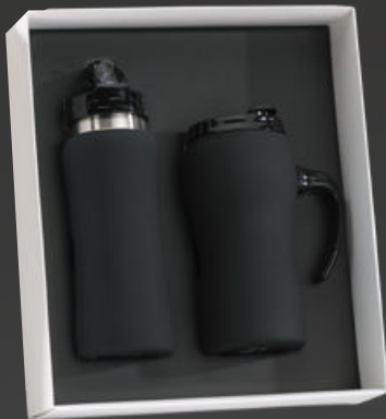
Drinkware set: Water Bottle, 600 ml. & Thermal Mug, 450 ml. HB01/HD01