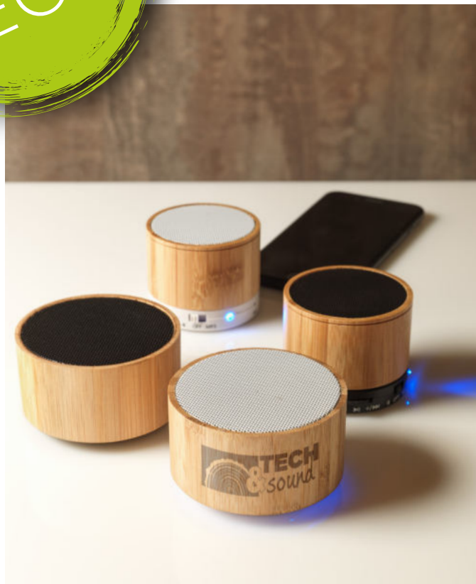
124100 COSMOS BAMBOO BLUETOOTH® SPEAKER 124101 EARTH BAMBOO BLUETOOTH® SPEAKER