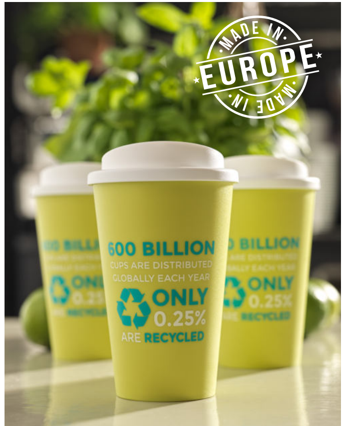
210001 AMERICANO® 350 ML INSULATED TUMBLER