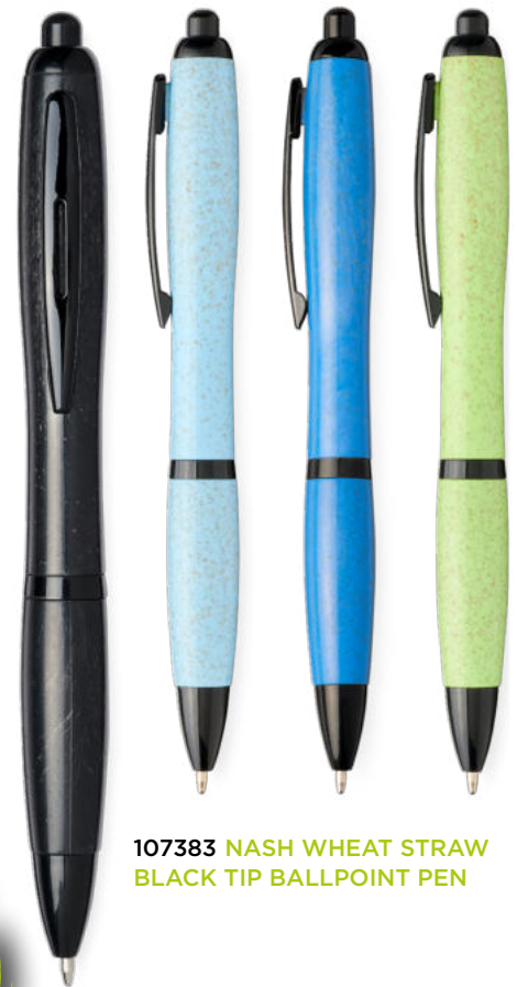
107383 NASH WHEAT STRAW BLACK TIP BALLPOINT PEN