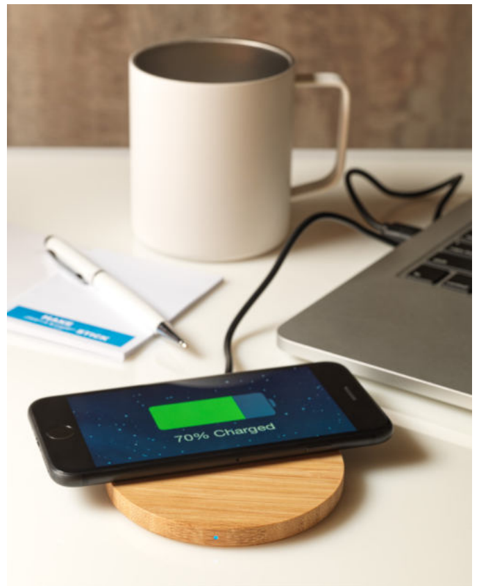
124105 ESSENCE BAMBOO WIRELESS CHARGING PAD