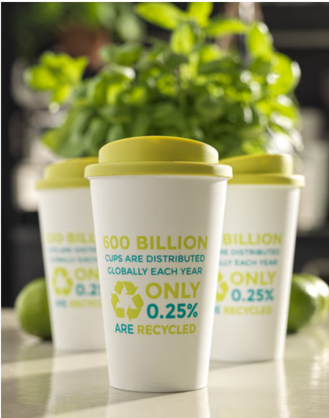
210001 AMERICANO® 350 ML INSULATED TUMBLER