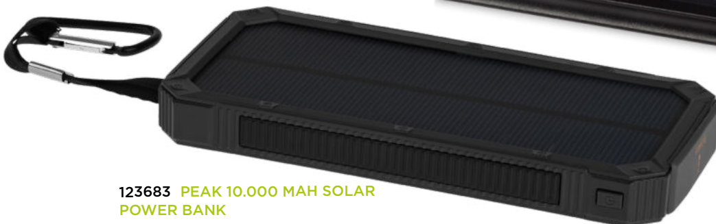
123683 PEAK 10.000 MAH SOLAR POWER BANK