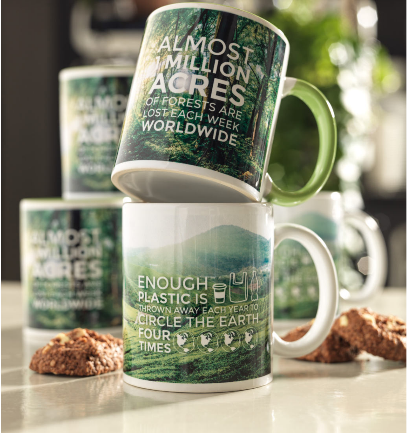
100377 PIX 330 ML CERAMIC SUBLIMATION MUG