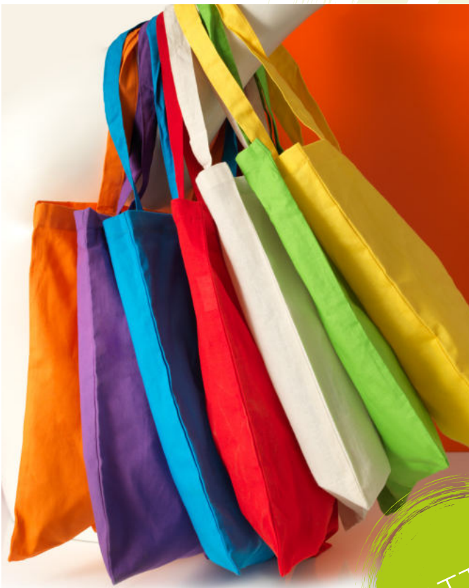
120181 MADRAS 140 G/M 2 COTTON TOTE