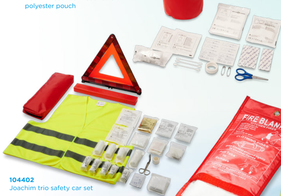
104402 Joachim trio safety car set