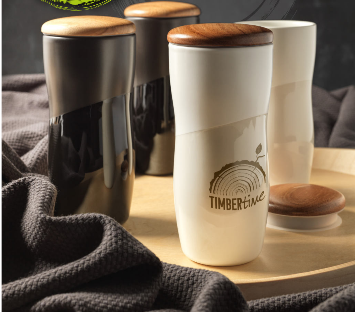
100592 RENO 370 ML DOUBLE-WALLED CERAMIC TUMBLER