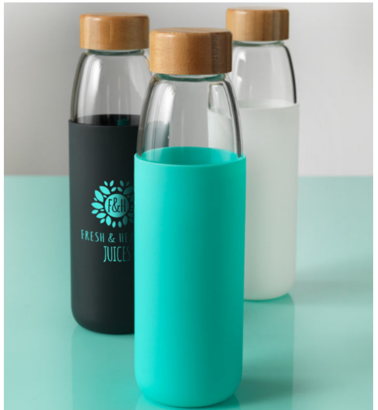
100550 KAI 540 ML GLASS SPORT BOTTLE WITH WOOD LID