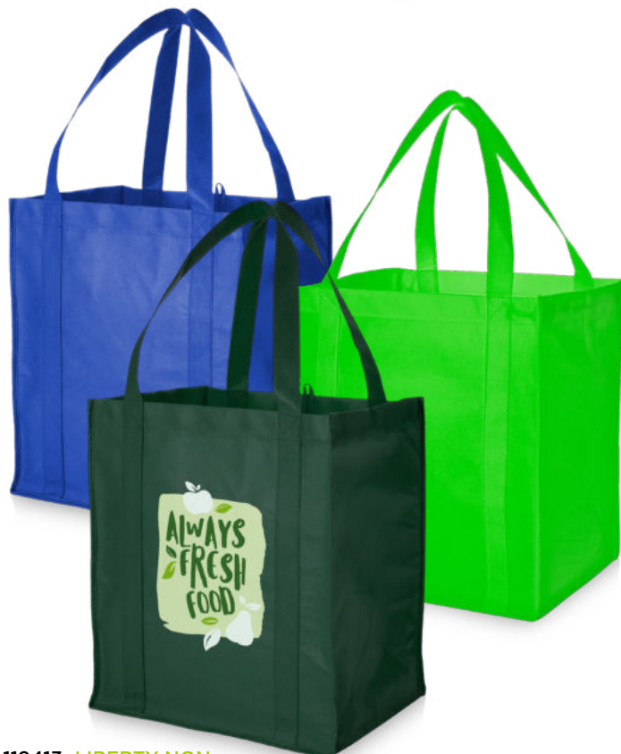
119413 LIBERTY NON WOVEN TOTE