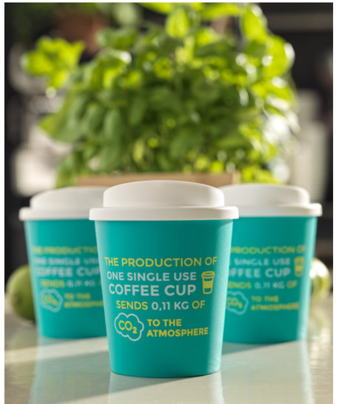
210092 AMERICANO® ESPRESSO 250 ML INSULATED TUMBLER