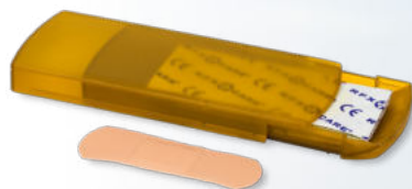
122004 Christian 5-piece plaster box