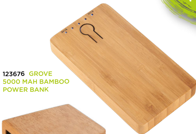
123676 GROVE 5000 MAH BAMBOO POWER BANK