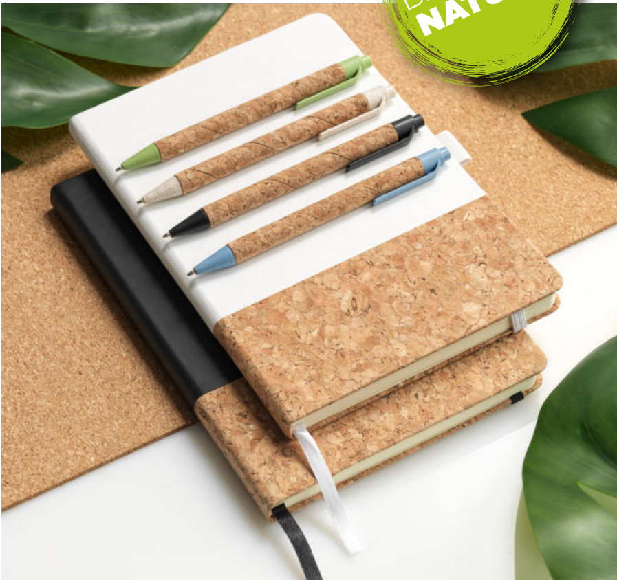
107385 MIDAR CORK AND WHEAT STRAW BALLPOINT PEN