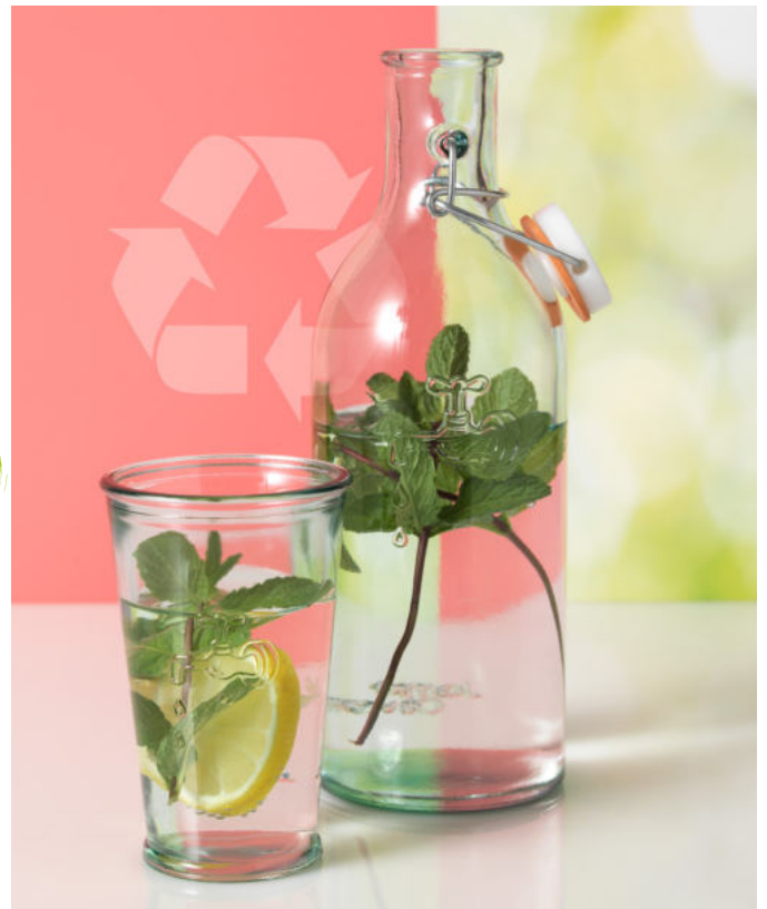
112271 RECYCLED CARAFE WITH GLASS