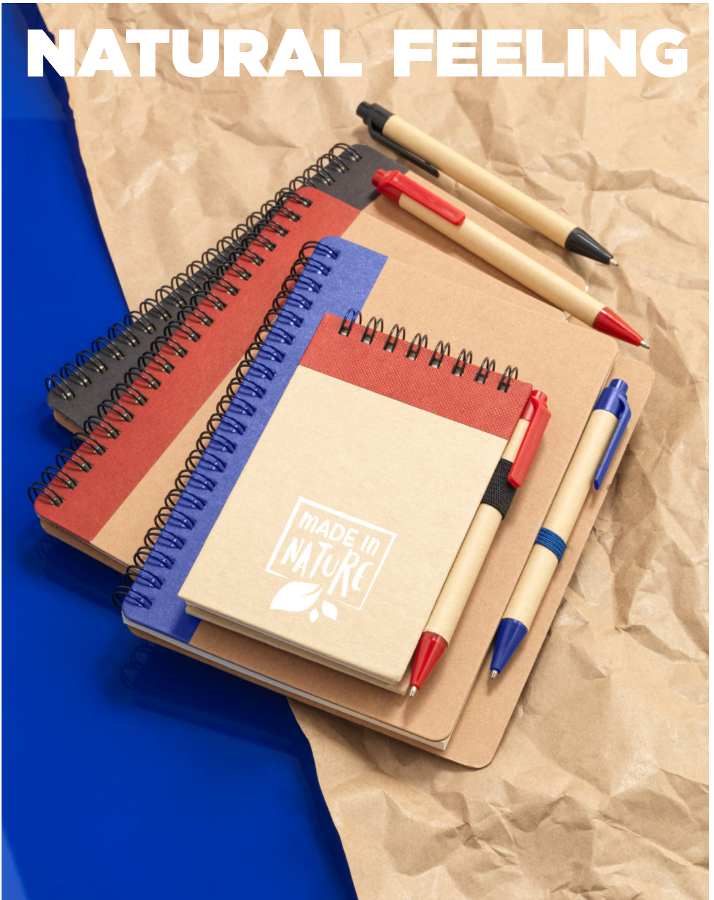
106268 PRIESTLY RECYCLED NOTEBOOK WITH PEN