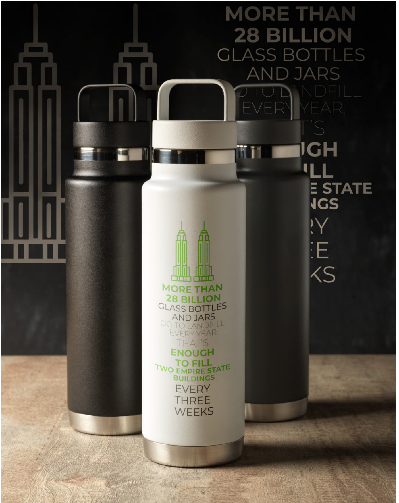
100590 COLTON 600 ML COPPER VACUUM INSULATED SPORT BOTTLE