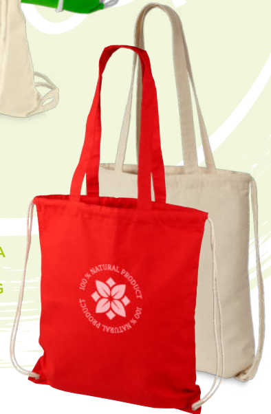
120276 ELIZA COTTON DRAWSTRING BACKPACK