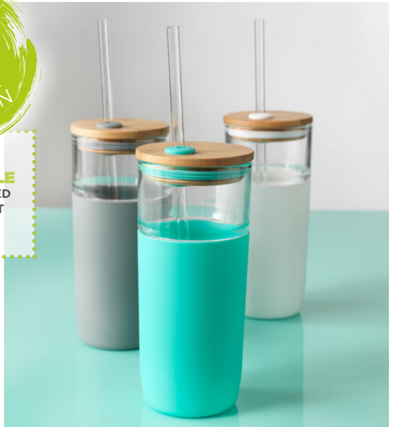
100486 ARLO 600 ML GLASS TUMBLER WITH BAMBOO LID