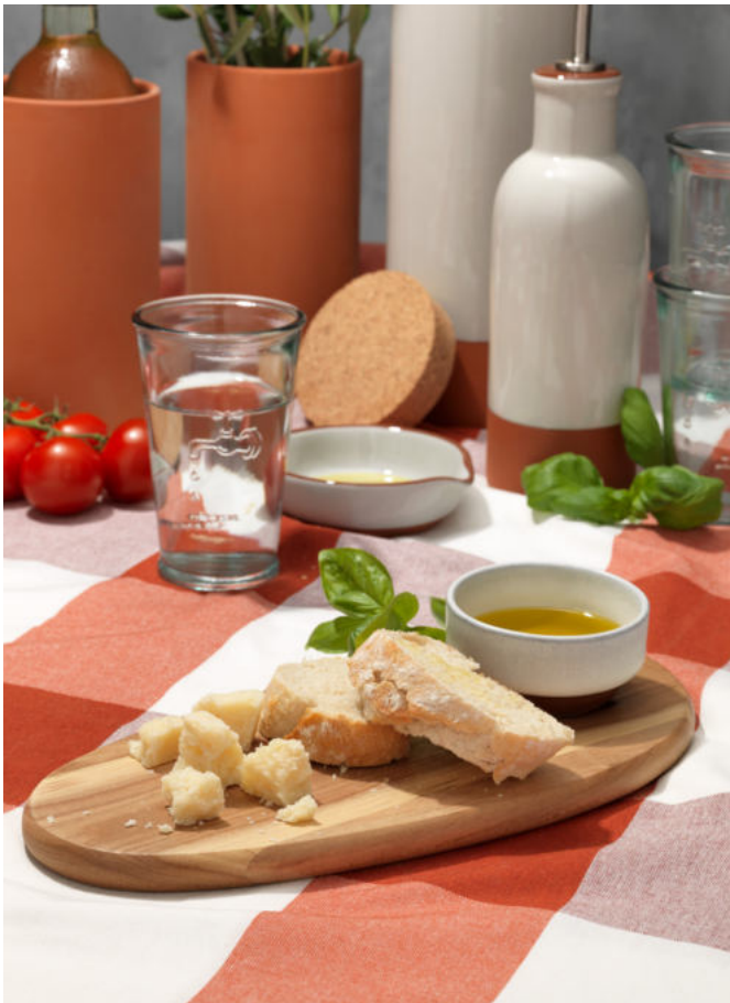
112974 BOLTON BRUSCHETTA SERVING BOARD