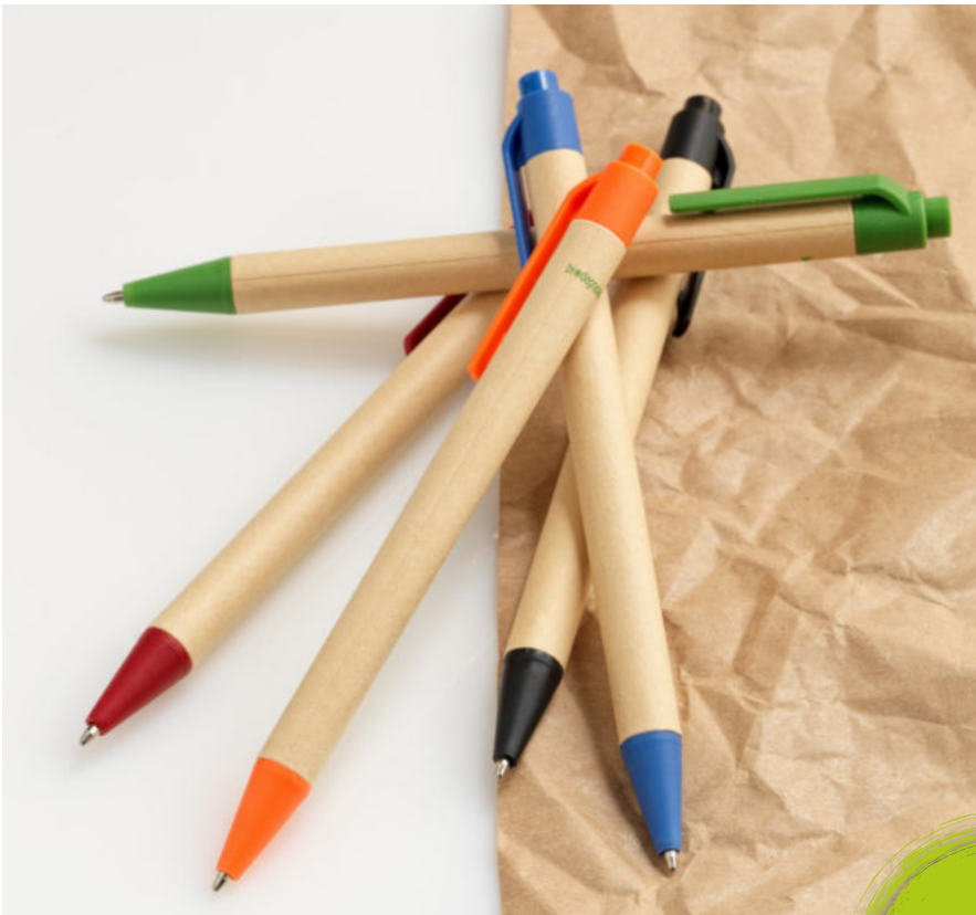
107384 BERKAN RECYCLED CARTON AND CORN BALLPOINT PEN