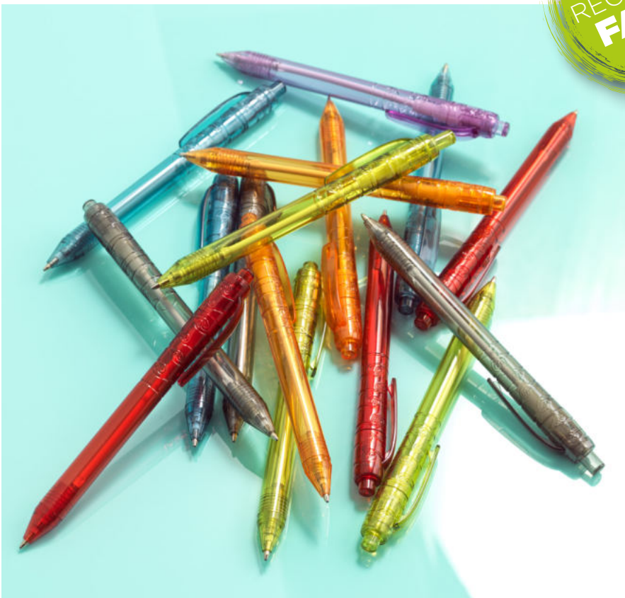
106578 VANCOUVER RECYCLED PET BALLPOINT PEN