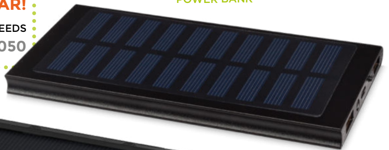
123688 STELLAR 8000MAH SOLAR POWER BANK

THE WHOLE WORLD COULD GET ALL THE POWER IT NEEDS FROM RENEWABLE RESOURCES BY 2050