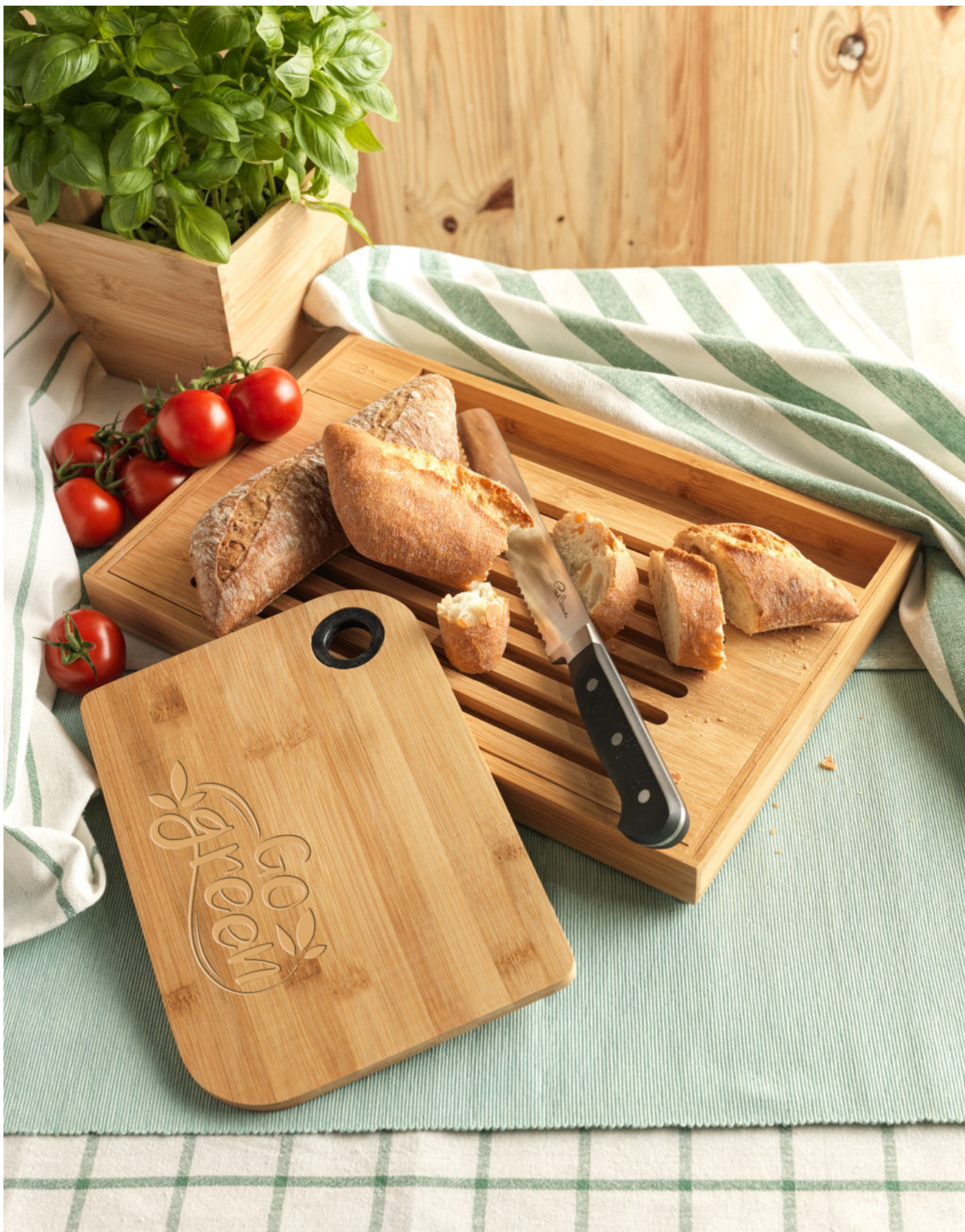
112873 MAIN WOODEN CUTTING BOARD