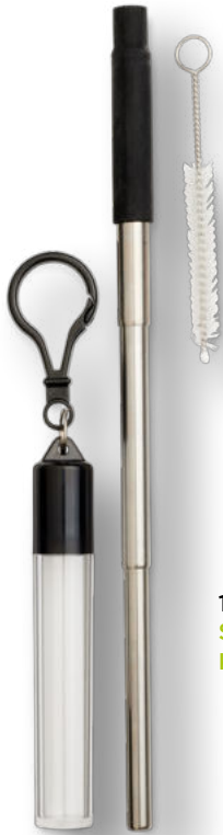
100586 ZEYA REUSABLE STAINLESS STEEL STRAW KEYCHAIN

MOST GLASS IS 100% RECYCLABLE AND CAN BE RECYCLED ENDLESSLY WITHOUT LOSS IN QUALITY OR PURITY