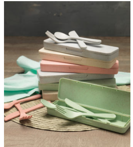
112996 BAMBERG BAMBOO FIBER CUTLERY SET