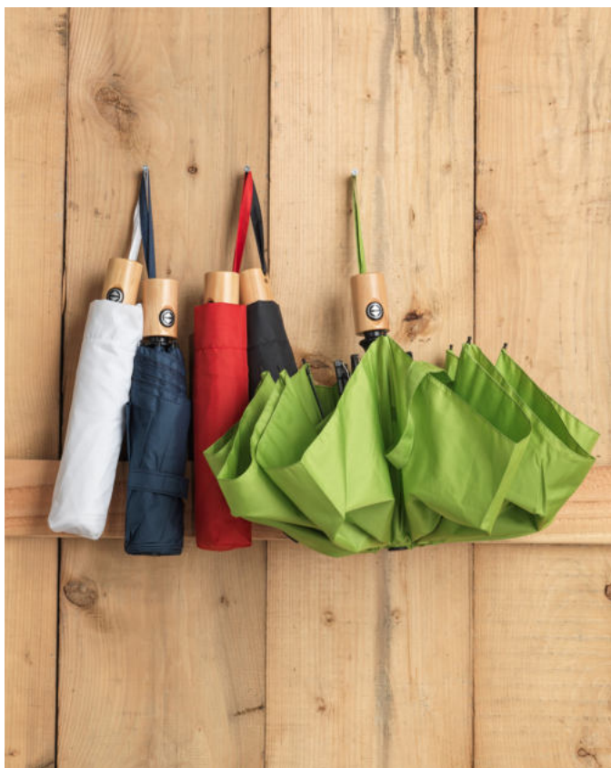
109143 RPET FOLDING UMBRELLA