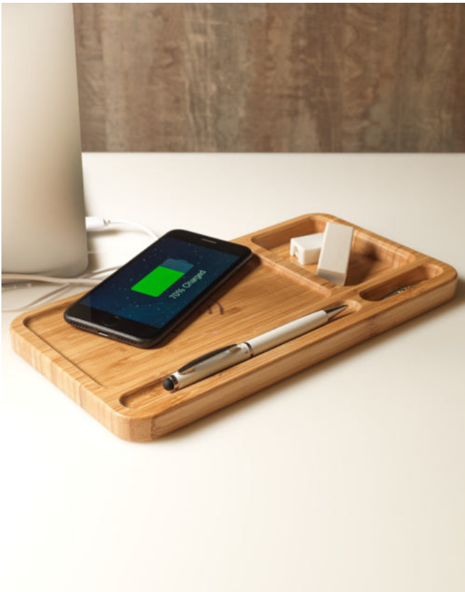
124102 FRAME WIRELESS CHARGING DESK ORGANISER