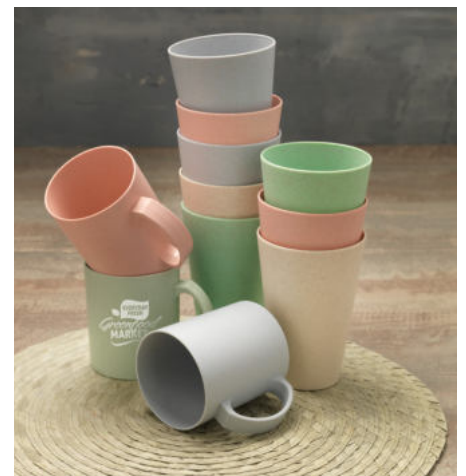
100615 GILA 430ML WHEAT STRAW TUMBLER