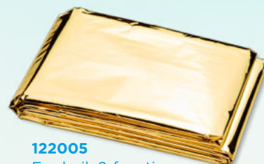
122005 Frederik 2-function emergency blanket