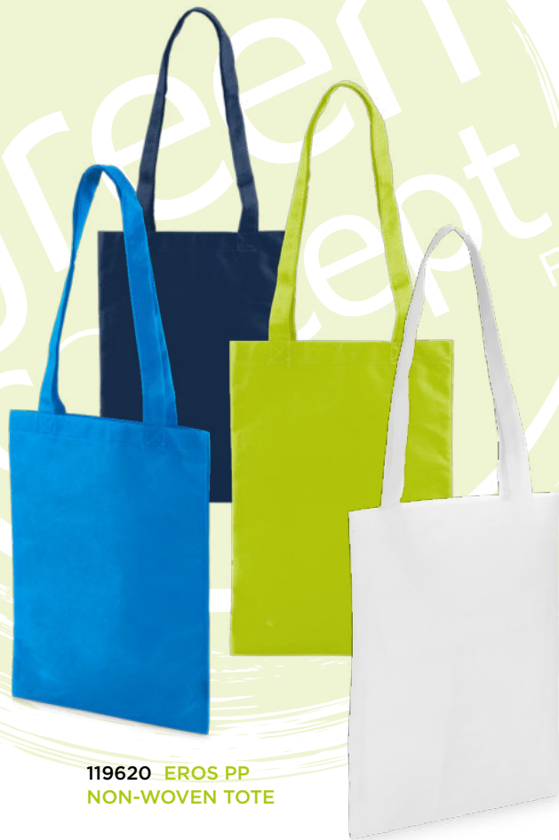
119620 EROS PP NON-WOVEN TOTE