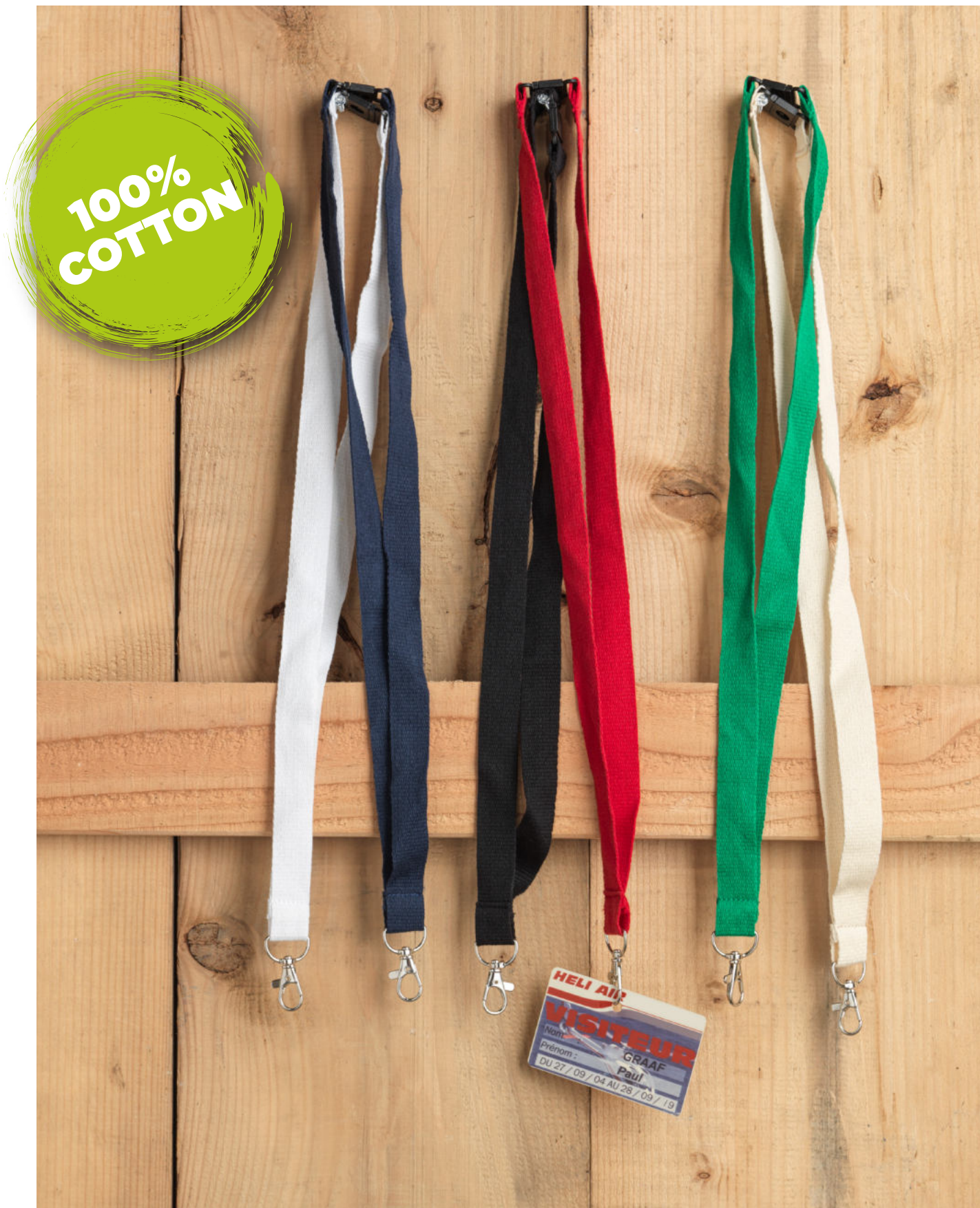
102512 DYLAN COTTON LANYARD WITH SAFETY CLIP