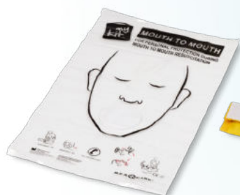
122010 Henrik mouth-to-mouth shield in polyester pouch