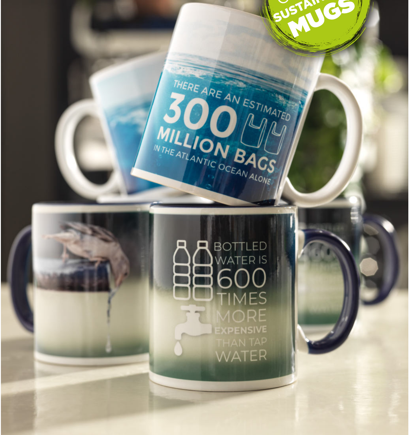
100377 PIX 330 ML CERAMIC SUBLIMATION MUG