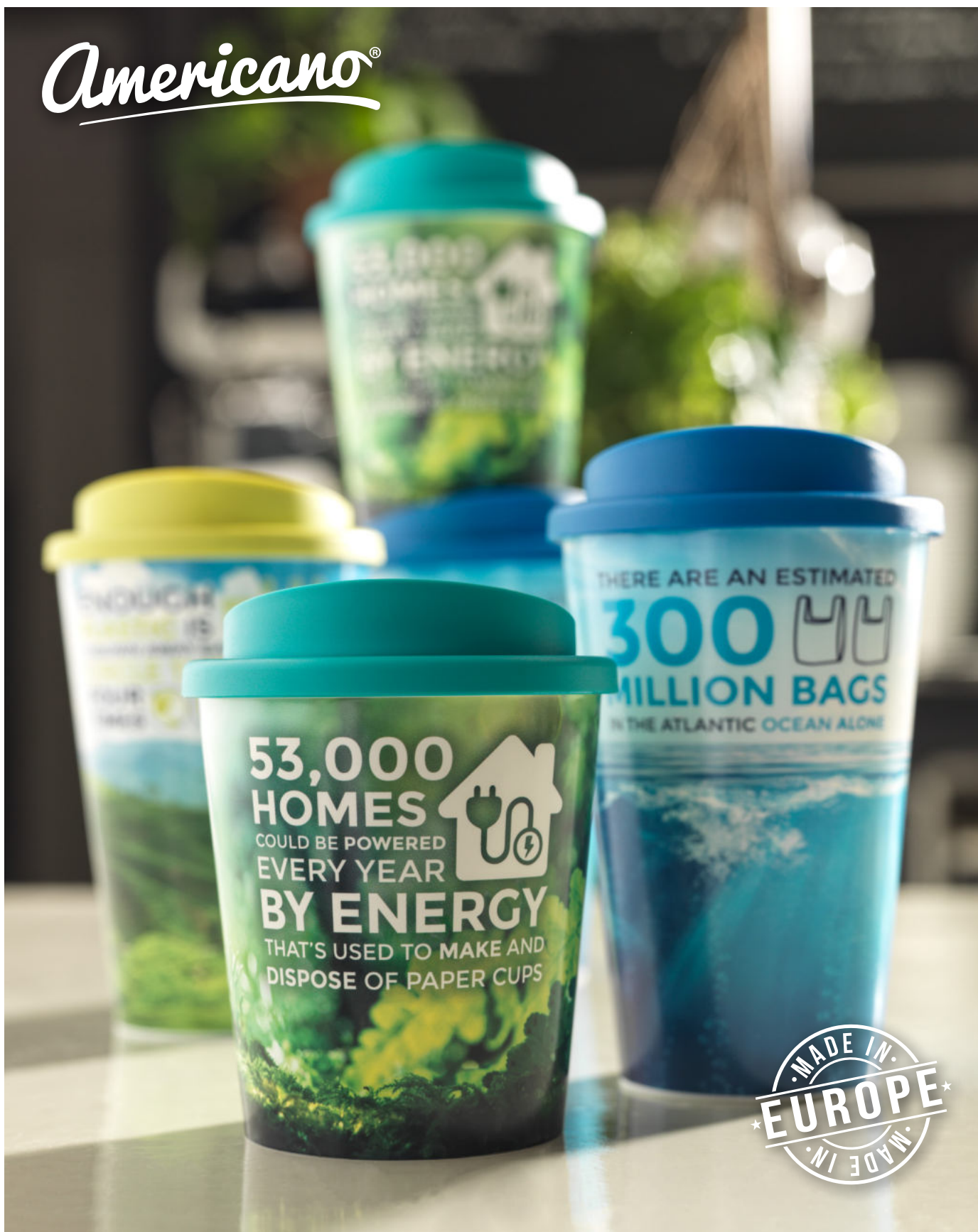
210091 BRITE-AMERICANO® ESPRESSO 250ML INSULATED TUMBLER