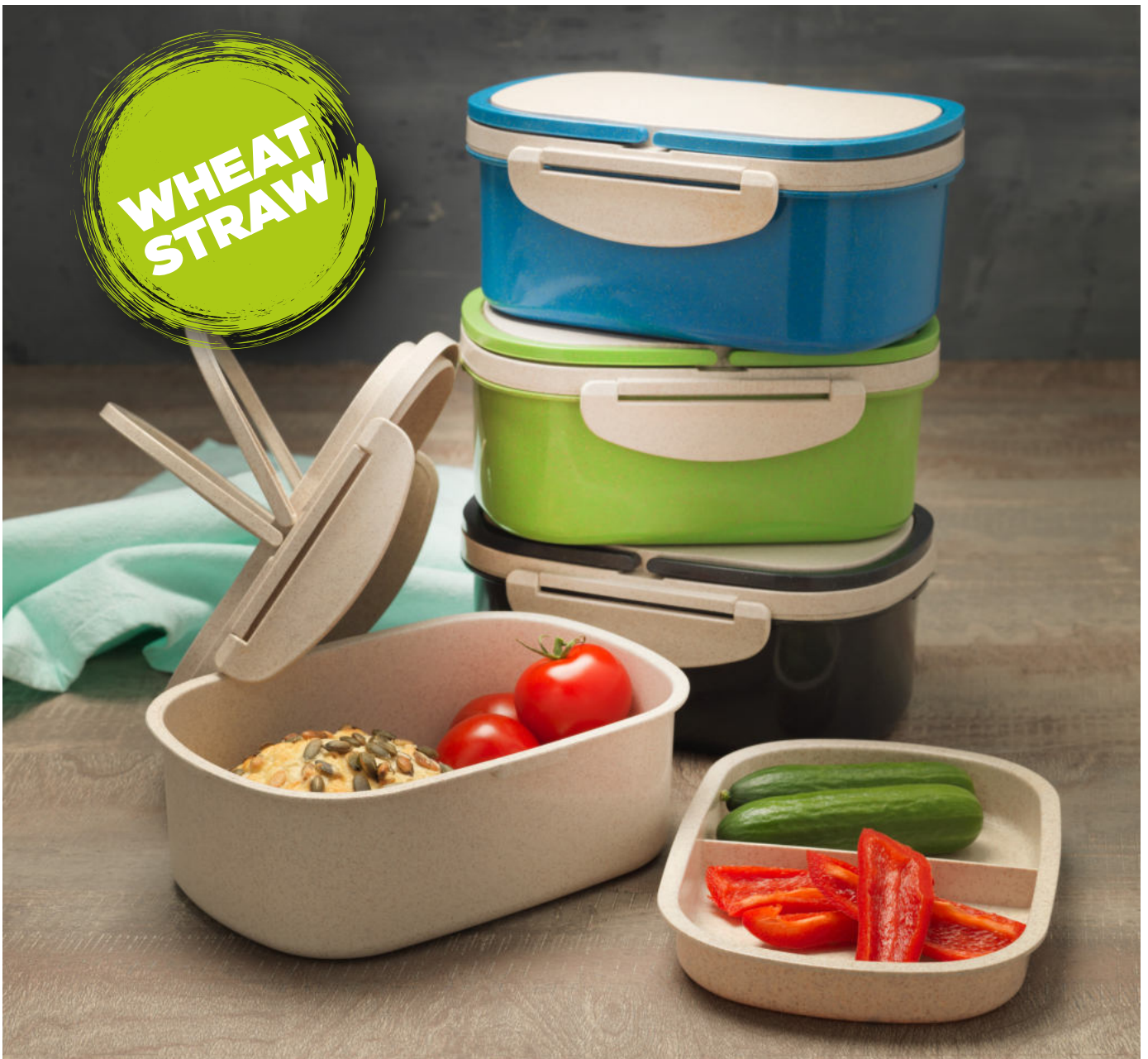
112994 CRAVE WHEAT STRAW LUNCHBOX