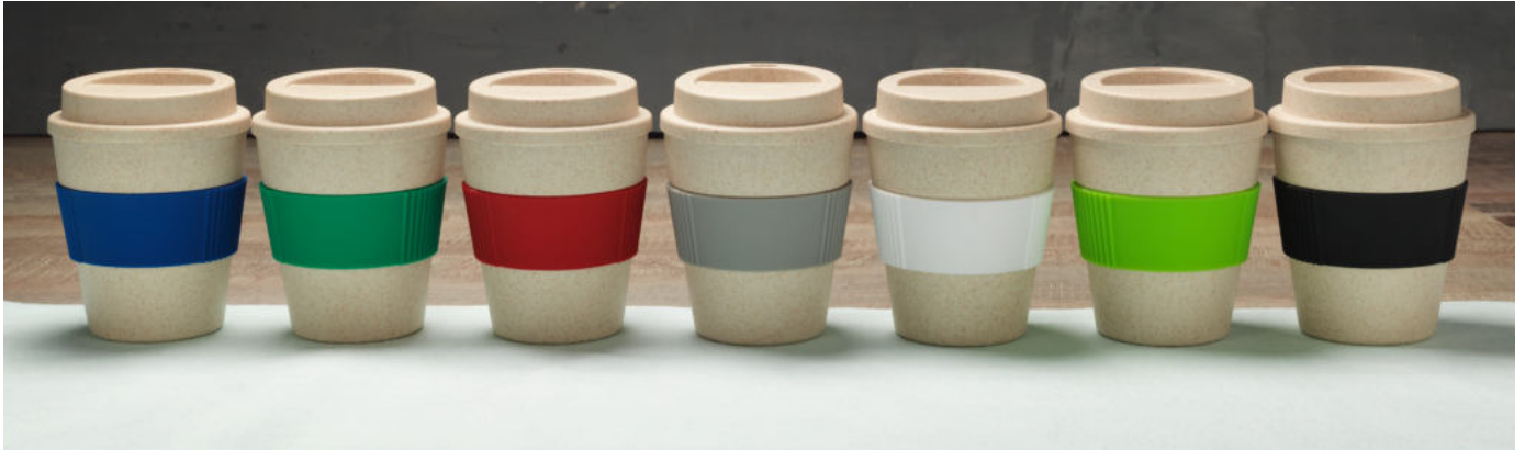
100576 OKA 350ML WHEAT STRAW TUMBLER