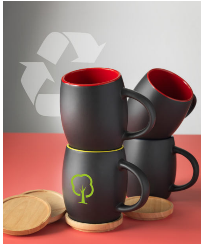
100466 HEARTH 400 ML CERAMIC MUG WITH WOODEN LID/COASTER