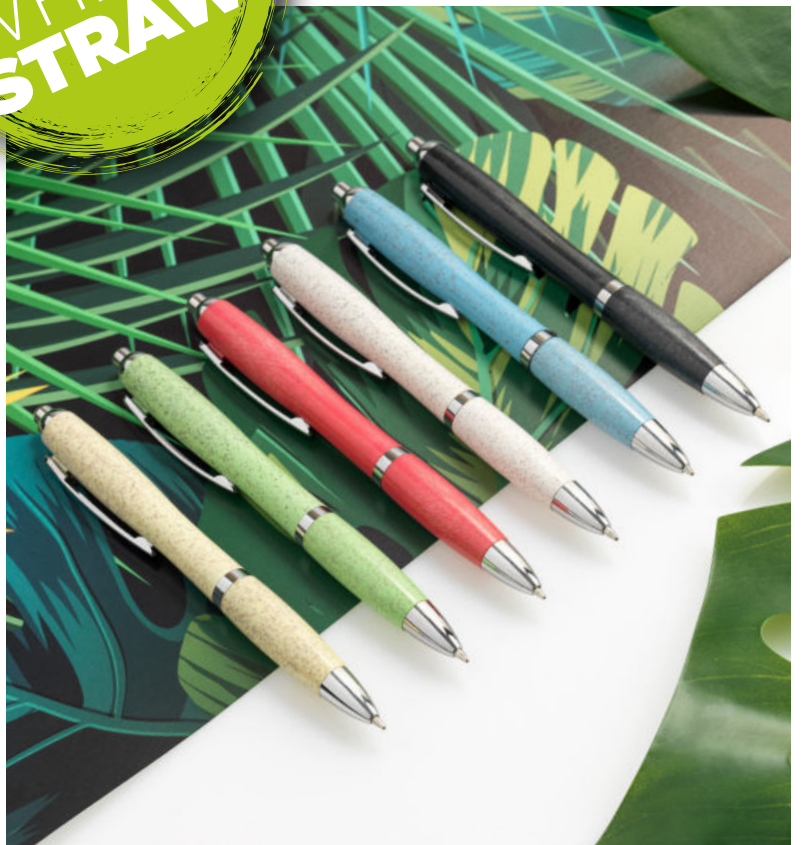
107379 NASH WHEAT STRAW CHROME TIP BALLPOINT PEN

WHEAT STRAW IS THE LEFT OVER STALK AFTER WHEAT GRAINS ARE HARVESTED, WHICH REDUCES THE AMOUNT OF PLASTIC USED BY AROUND 50%