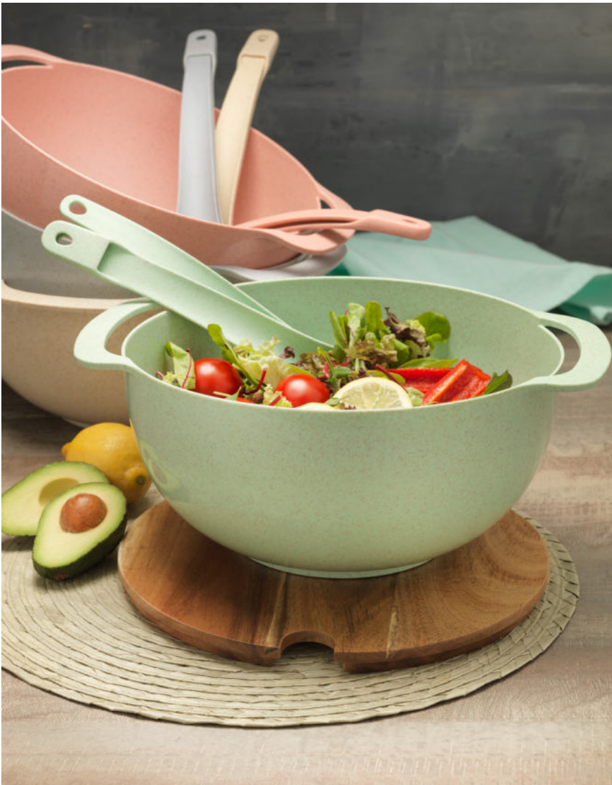
112993 LUCHA WHEAT STRAW SALAD BOWL WITH SERVERS