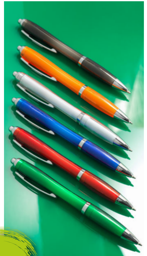
107377 NASH RECYCLED PET BALLPOINT PEN