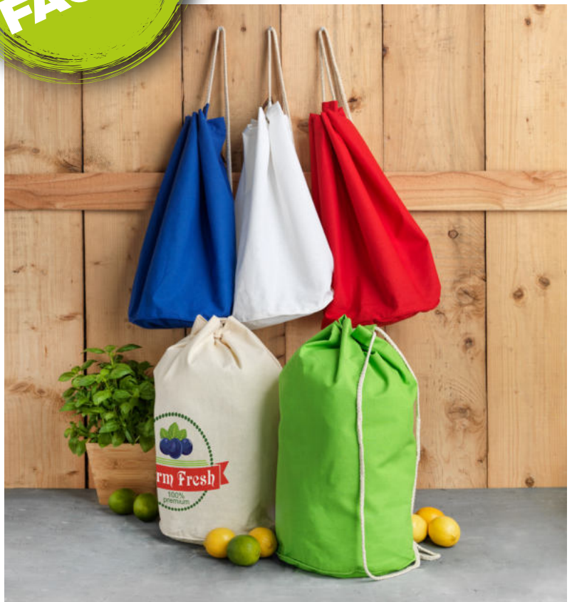
120111 MISSOURI COTTON SAILOR BAG

ROUGHLY 1.6 POUNDS OF OTHER USEFUL PRODUCTS BEING CREATED