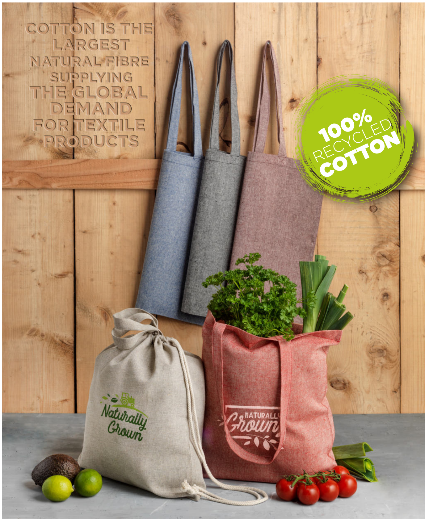
120459 PHEEBS 150 G/M 2 RECYCLED COTTON DRAWSTRING BAG