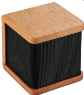
108304 SENECA WOODEN BLUETOOTH® SPEAKER