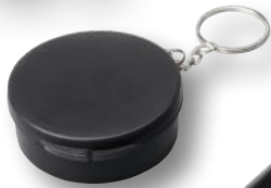
100573 RHINE REUSABLE SILICONE STRAW KEY- CHAIN