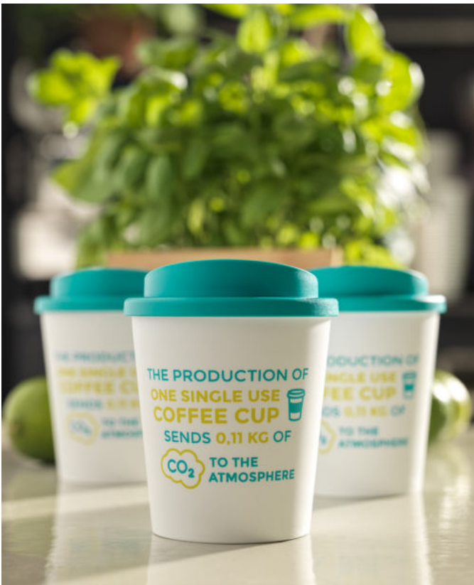
210092 AMERICANO® ESPRESSO 250 ML INSULATED TUMBLER