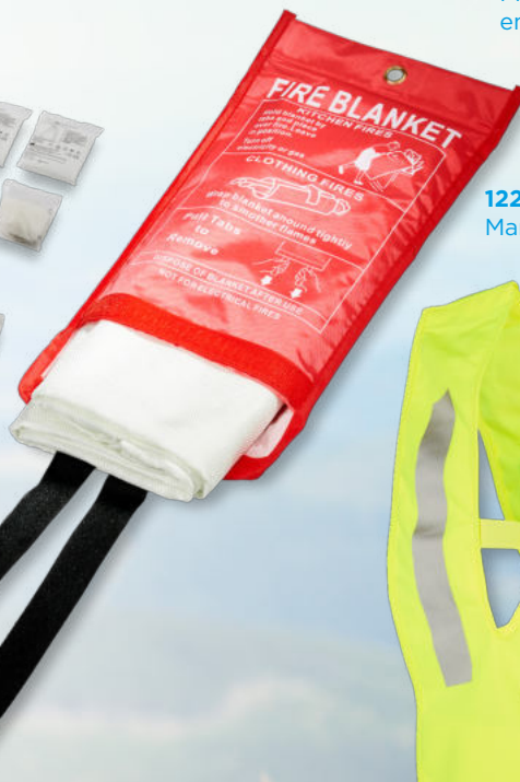
122003 Margrethe emergency fire blanket