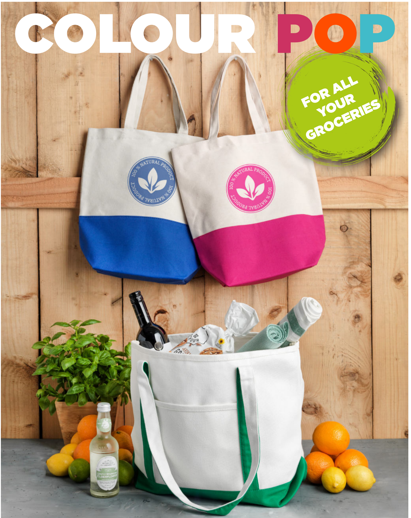
120258 COLOUR POP 284 G/M 2 COTTON TOTE