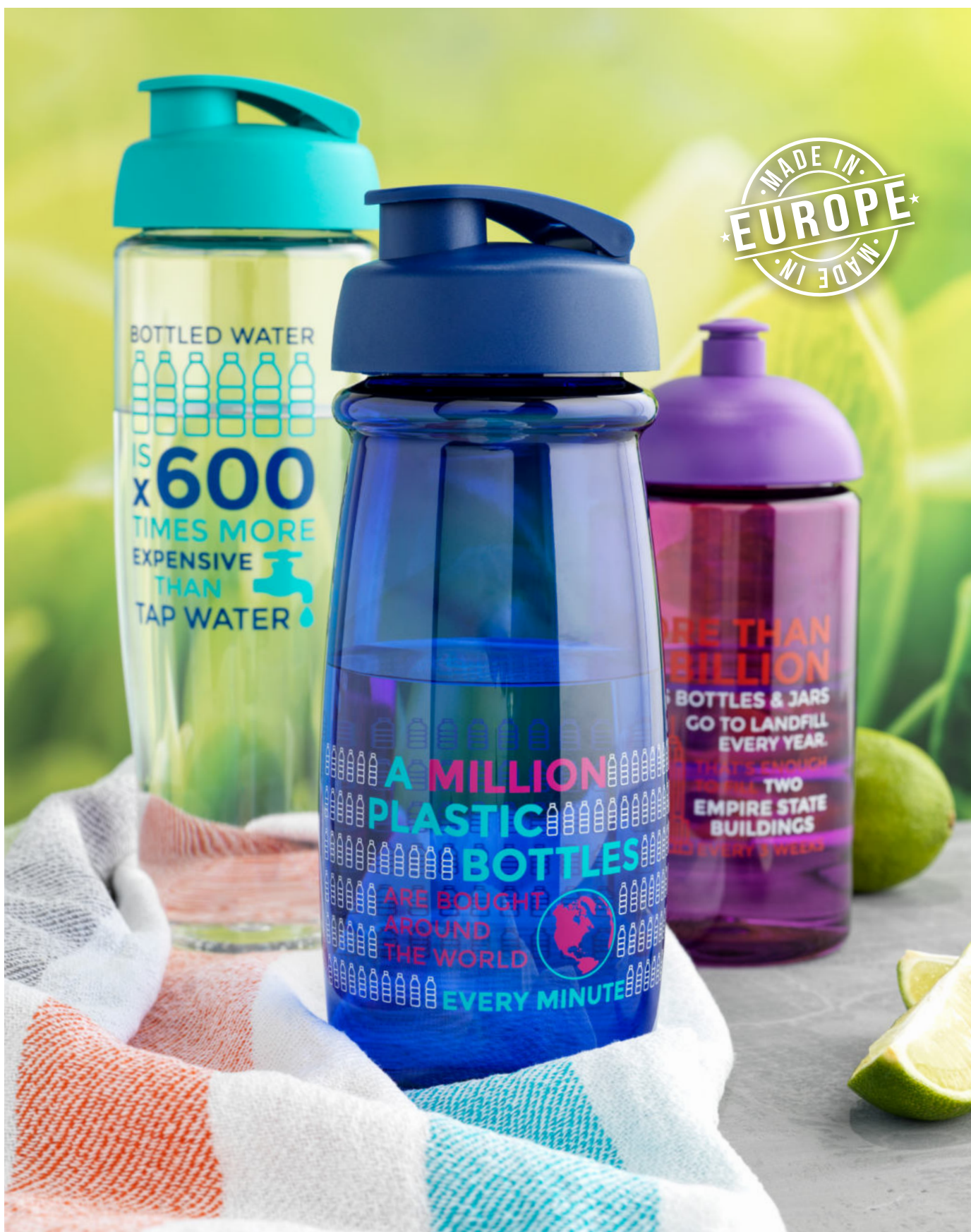
210040 H2O TEMPO® 700 ML FLIP LID SPORT BOTTLE