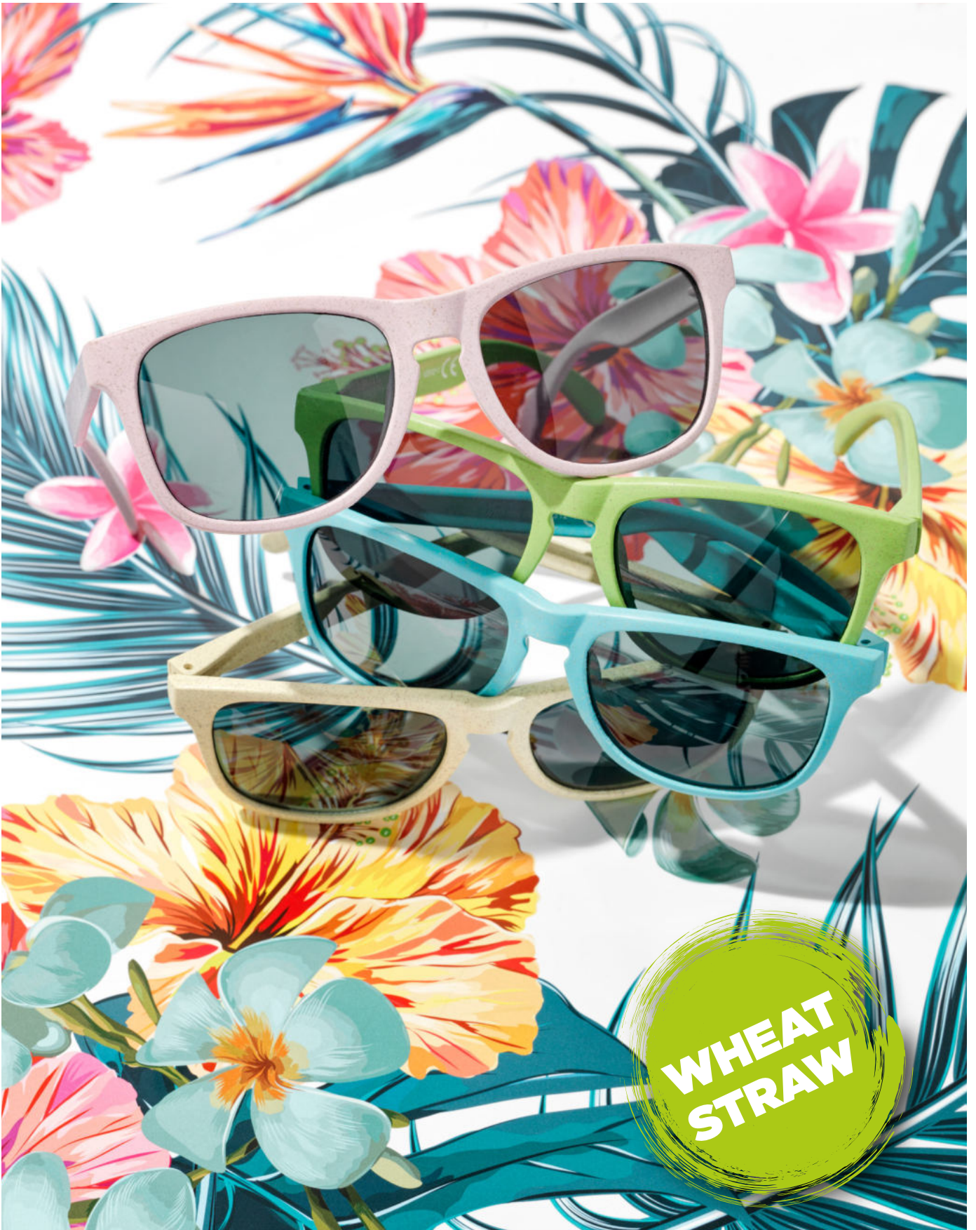
101001 RONGO WHEAT STRAW SUNGLASSES