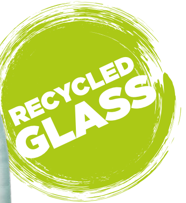
112691 RECYCLED CARAFE