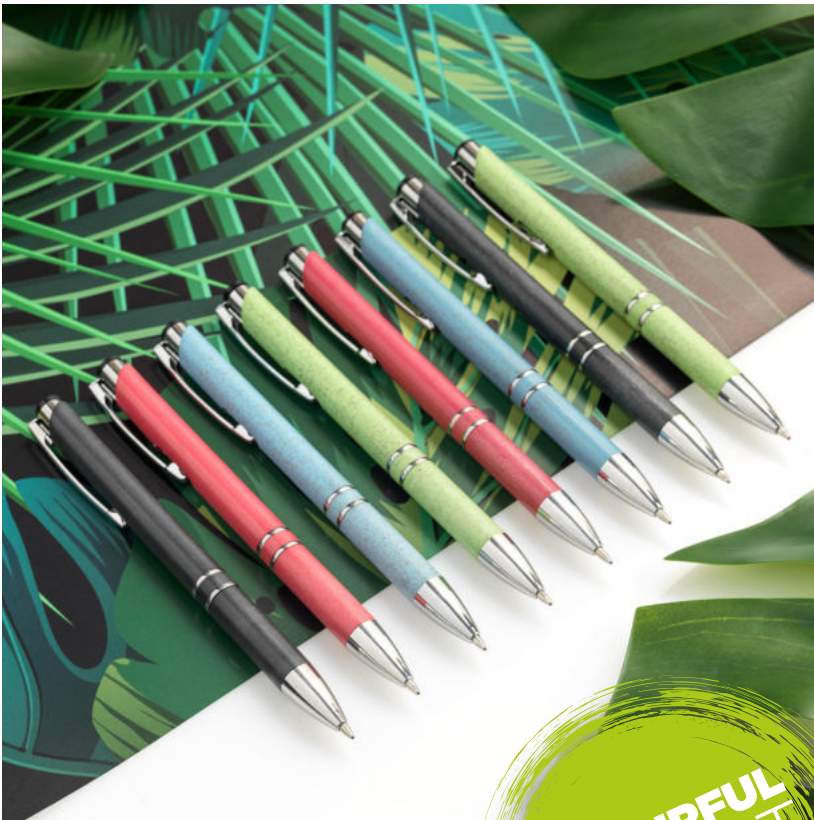
107382 MONETA WHEAT STRAW BALLPOINT PEN