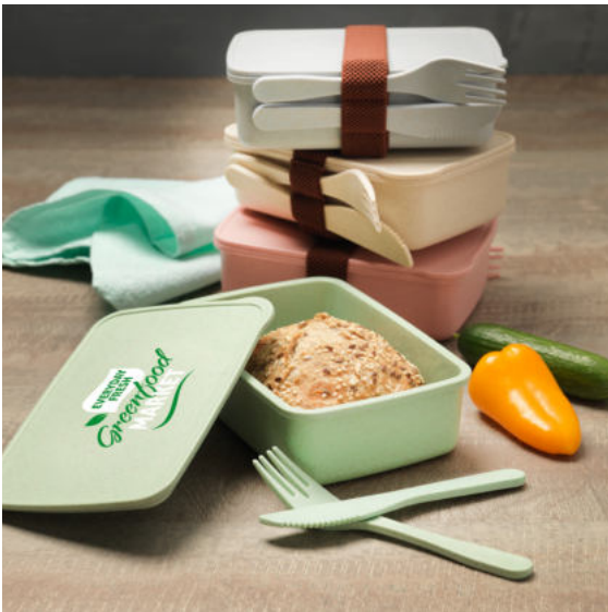
112986 BAMBERG BAMBOO FIBER LUNCHBOX