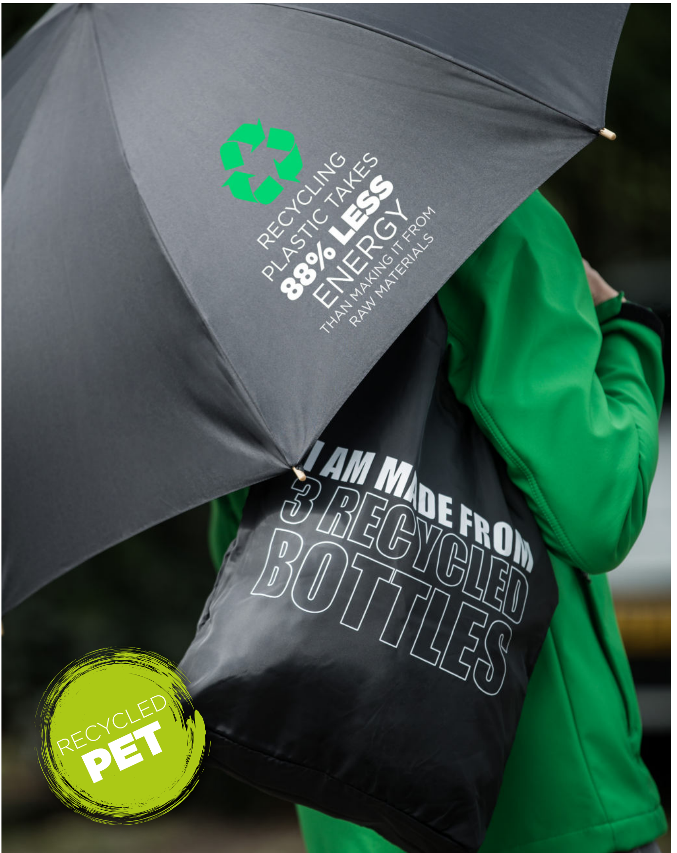
109400 RPET STRAIGHT UMBRELLA