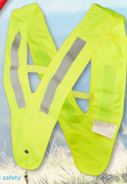
122015 Nikolai v-shaped safety vest for kids