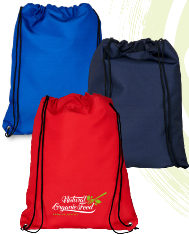
120461 ORIOLE RPET DRAWSTRING BAG