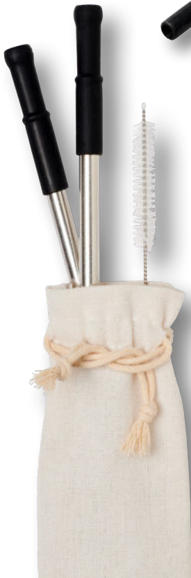
100574 LENA REUSABLE STAINLESS STRAW SET