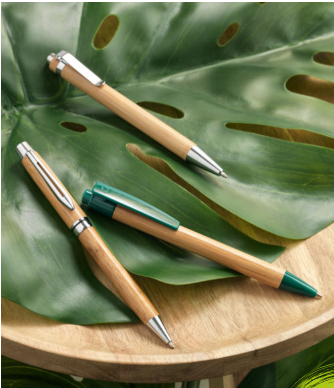
106282 JAKARTA BAMBOO PEN 106322 BORNEO BAMBOO PEN 106212 CELUK BAMBOO BALLPOINT PEN