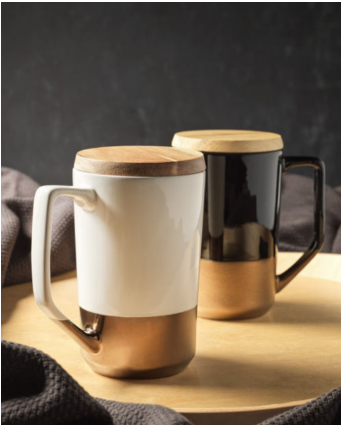
100537 TAHOE 470 ML CERAMIC MUG WITH WOODEN LID