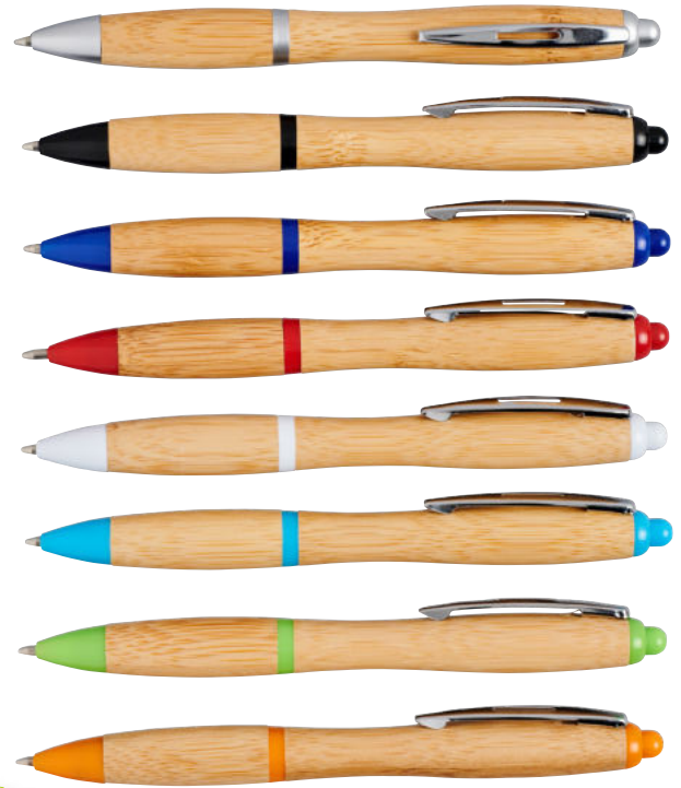
107378 NASH BAMBOO BALLPOINT PEN