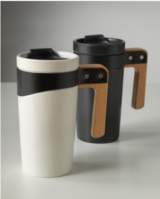
100430 GROTTA 475 ML CERAMIC MUG