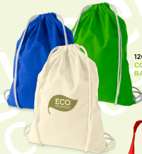
120113 OREGON COTTON DRAWSTRING BACKPACK