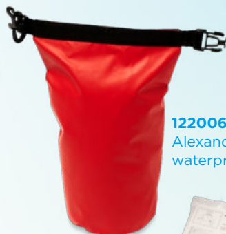
122006 Alexander 30-piece first aid waterproof bag