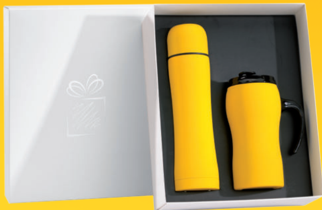
THERMAL MUG & THERMOS SET (HD01/HT01)