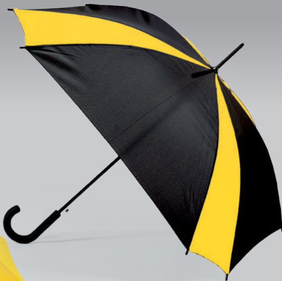
SAINT TROPEZ UMBRELLA (UP30)

A very robust umbrella from the Cambridge collection with DAS (Double Automatic System) and an antiwind system. The frame is made from metal and the handle is covered with ABS plastic for a safe grip and a nice feeling. It is ideal for women's handbags.