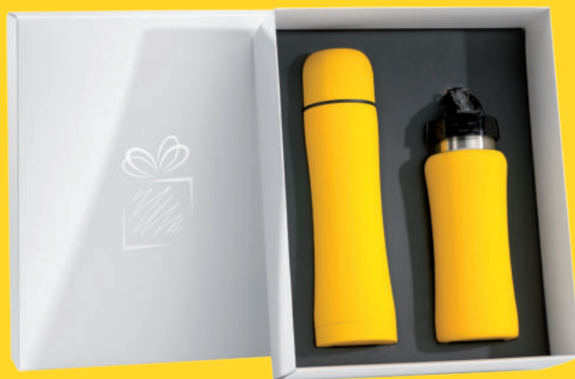
WATER BOTTLE & THERMOS SET (HB01/HT01)