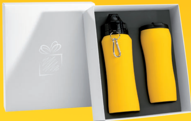
WATER BOTTLE & THERMAL MUG SET (HB02/HD02)