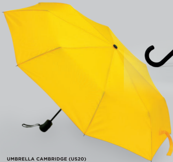
UMBRELLA CAMBRIDGE (US20)

A very robust umbrella from the Cambridge collection with DAS (Double Automatic System) and an antiwind system. The frame is made from metal and the handle is covered with ABS plastic for a safe grip and a nice feeling. It is ideal for women's handbags.