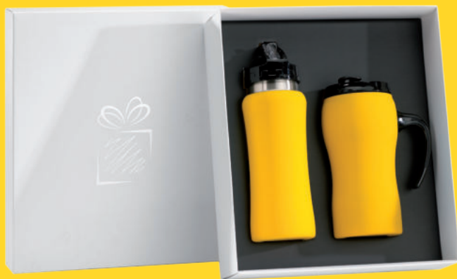
THERMAL MUG & WATER BOTTLE SET (HD01/HB01)