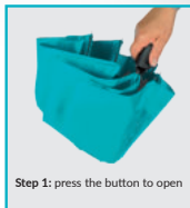
Step 1: press the button to open

A very robust umbrella from the Cambridge collection with DAS (Double Automatic System) and an antiwind system. The frame is made from metal and the handle is covered with ABS plastic for a safe grip and a nice feeling. It is ideal for women's handbags.