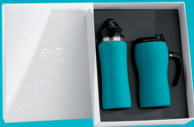
THERMAL MUG & WATER BOTTLE SET (HD01/HB01)