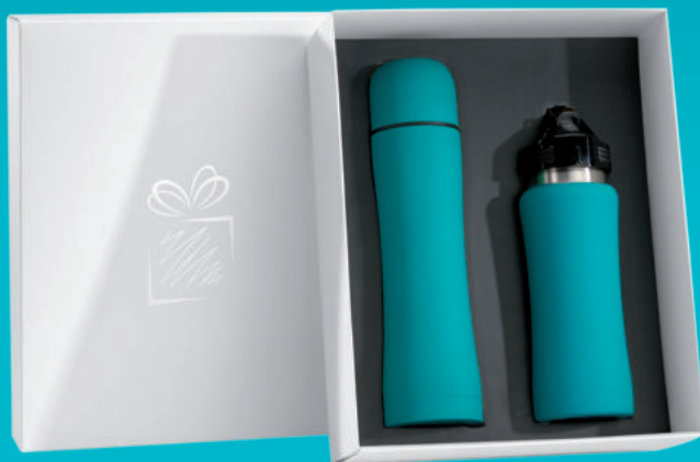
WATER BOTTLE & THERMOS SET (HB01/HT01)