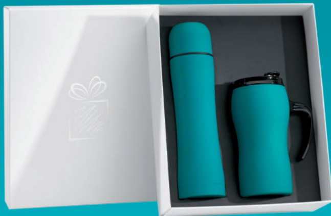
THERMAL MUG & THERMOS SET (HD01/HT01)