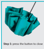
Step 1: press the button to close