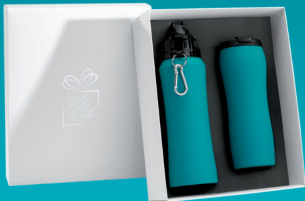
WATER BOTTLE & THERMAL MUG SET (HB02/HD02)