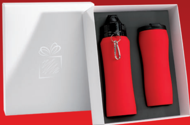
WATER BOTTLE & THERMAL MUG SET (HB02/HD02)