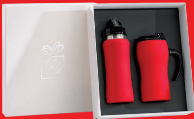
THERMAL MUG & WATER BOTTLE SET (HD01/HB01)