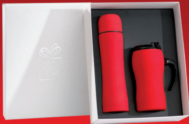
THERMAL MUG & THERMOS SET (HD01/HT01)