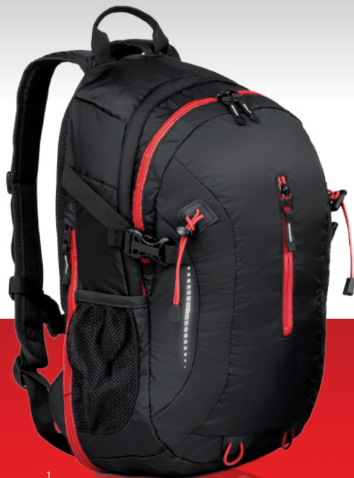
1. OUTDOOR BACKPACK FLASH L (LPN501) 2. OUTDOOR BACKPACK FLASH M (LPN525)