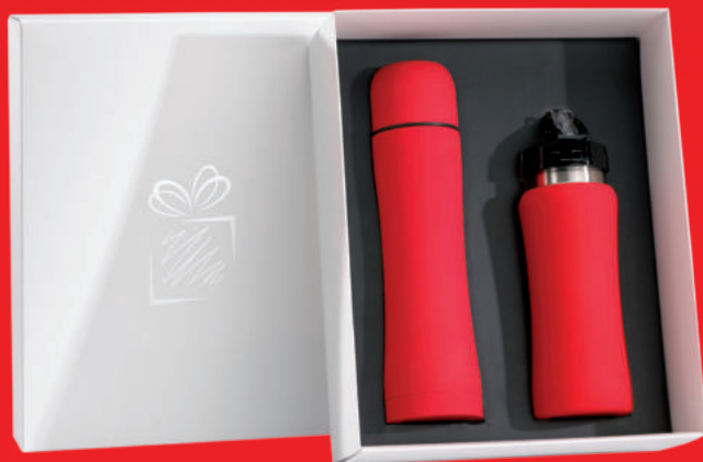
WATER BOTTLE & THERMOS SET (HB01/HT01)