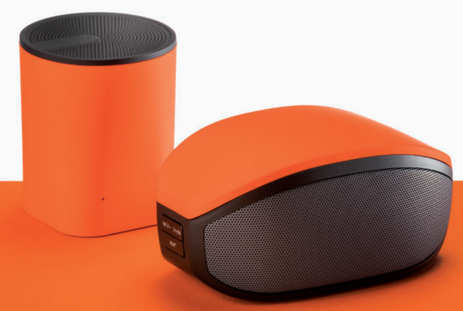
HANDS FREE CALL