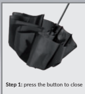
Step 1: press the button to close