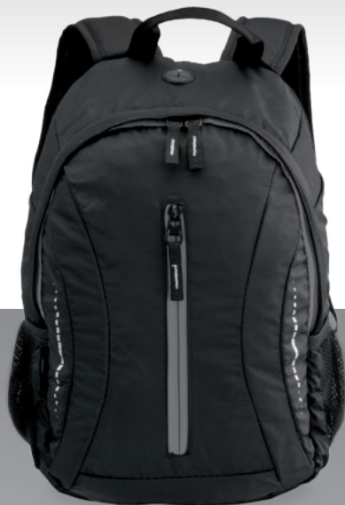
SPORT BACKPACK FLASH S (LPN550)

Sport backpack Flash S has a headphone output, breathable back, reflective elements, side mesh pockets and 1 main pocket with an internal organiser, as well as 1 small zipped pocket on the front of the backpack. Perfect for short trips.