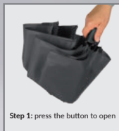
Step 1: press the button to open