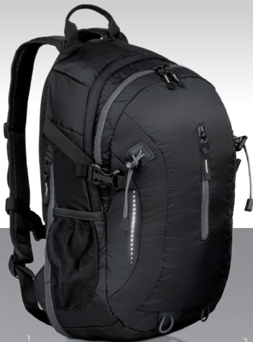
1. OUTDOOR BACKPACK FLASH L (LPN501) 2. OUTDOOR BACKPACK FLASH M (LPN525)