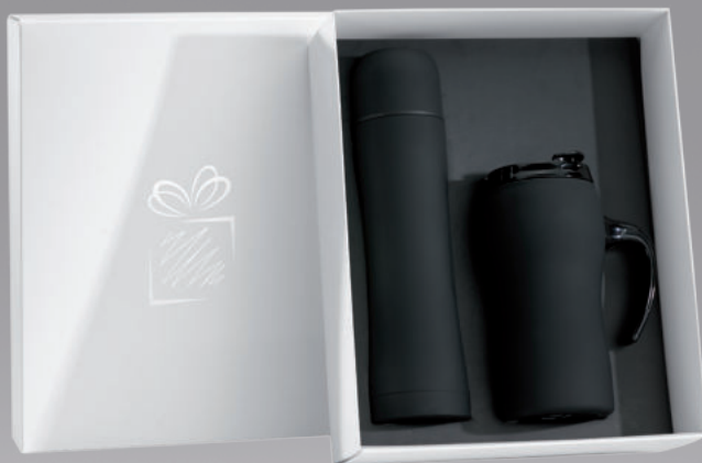
THERMAL MUG & THERMOS SET (HD01/HT01)