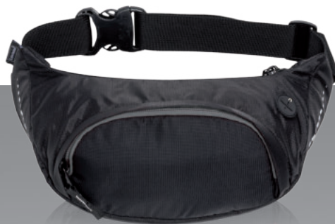
HIP BAG FLASH (LNN501)

Hip Bag from the Flash collection made of tear-resistant, very durable material. It has a capacious pocket closed with a zipper. Equipped with an adjustable strap, headphone output and air flow system on the back.