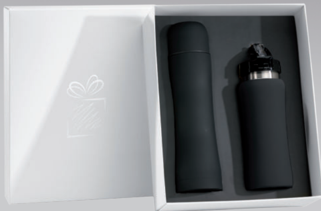
WATER BOTTLE & THERMOS SET (HB01/HT01)