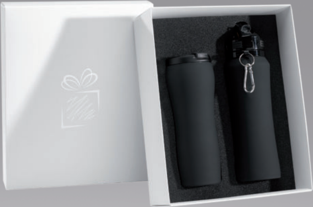
WATER BOTTLE & THERMAL MUG SET (HB02/HD02)